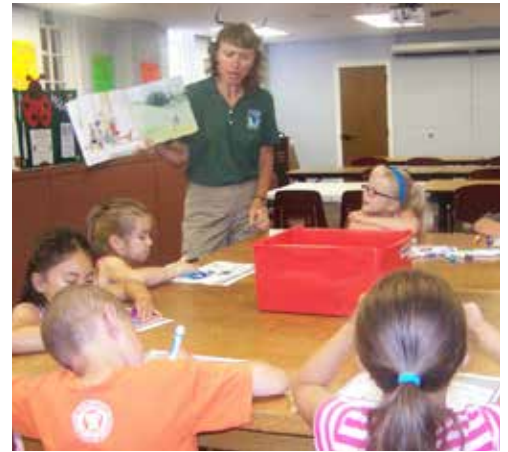
A lot of buggy fun-a story,a craft and a snack-was had at local libraries during our Story Walk kick off.