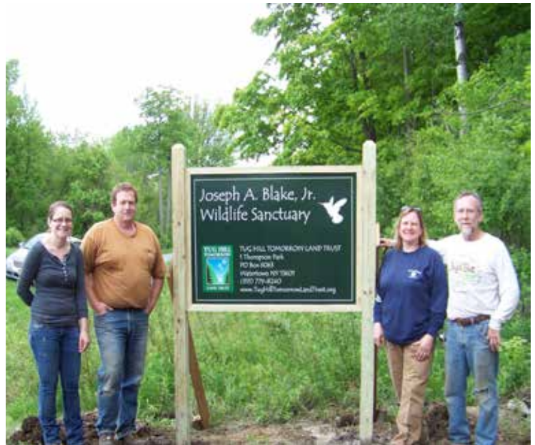
Staff and Volunteers work to install the new entrance sign and kiosk

If you haven't had the chance to check out the latest and greatest place to hike in the Watertown area, take some time and come out for a hike. Over the past year and a half THTLT has been diligently working with many volunteers from the community and two Eagle Scout candidates, to improve the access and trail network at the Wildlife Sanctuary. Thanks to a grant from the Land Trust Alliance Conservation Partnership Program, we were able to develop a parking area, put up new signs and expand the trail system. This past summer we held monthly programs for kids looking for critters in the pond, using all our senses to experience the forest, and having a fun adventure with a good book. They encounter endless opportunities to observe nature.